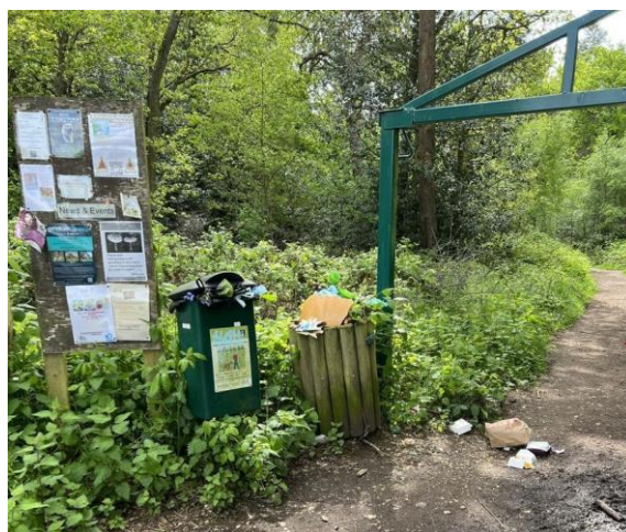
Figure 1: Bunces Lane, Wokefield

After the excitement of the election, I came down to earth quickly when reading, albeit from a safe distance of a foreign holiday, via Facebook, residents' concern over uncollected general and dog waste from bins in Burghfield Common and Wokefield. It was clear that many residents had reported the problem and that Burghfield Parish Council's clerk was chasing the relevant teams regularly. One resident had even emptied a Rec. bin himself and took the rubbish home. The reason for the delay emptying is that a member of staff left, and their replacement needed some time to get to grips with the rounds and all the bin locations. For the avoidance of doubt, the council knows where they are and has systems that track the emptying and monitor the web site for reports of full bins. Apparently in the district overall we make about 500 bin collections per week. Most of the Burghfield general and dog bins were belatedly emptied before the late May Bank Holiday but unfortunately those at the end of Bunces Lane (part of Wokefield), pictured, were missed. After I spoke with the Countryside team earlier this week, they met their contractor. I am assured those bins will be emptied imminently (by 1 June). To summarise the general advice: