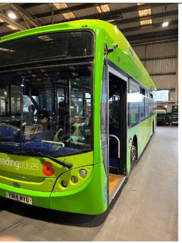
Figure 6:the No 2 bus in for repair after its altercation with a pole.