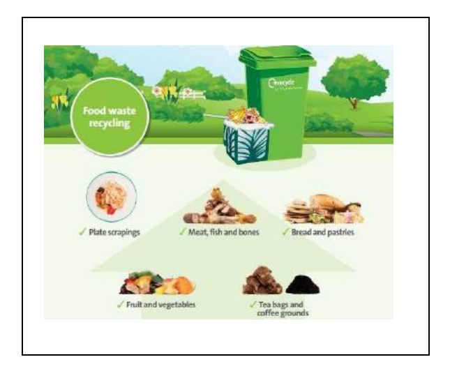
Figure 7:food waste recyclables

The government has announced plans (<u>HERE</u>) to streamline recycling collections across the country to ensure that all residents have the same level of service and move forward with a deposit return scheme for drink containers. West Berkshire is aligned with these recycling proposals which cover the recyclable waste types of paper and card, plastic, glass, metal, food waste, and garden waste. Separately on 1 October new rules came in to reduce plastic waste (details <u>HERE</u>)