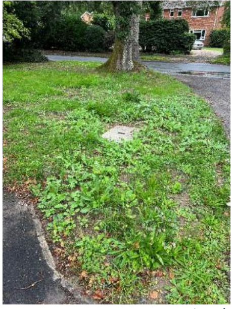
Figure 8:Stanmore Gardens/Drury Lane, Mortimer

Gigaclear As completes its network extensions in Mortimer and Burahfield Common, and newly connected consumer report delight at the service, the quality of re instatement of land is poor. The relevant council officer told me that Gigaclear is currently failing about 8 of 10 times when its reinstatement work is checked. The officer visited Mortimer on 9 October to view and agree remedial action with them. Meanwhile if you live in a property where you feel the quality of remedial work outside is poor, please log it on line, in the usual way HERE. If you don't get a convincing response within 10 days please feel free to forward me your incident email. Please note that the council's powers to insist that Gigaclear make good unmade roads is negligible.