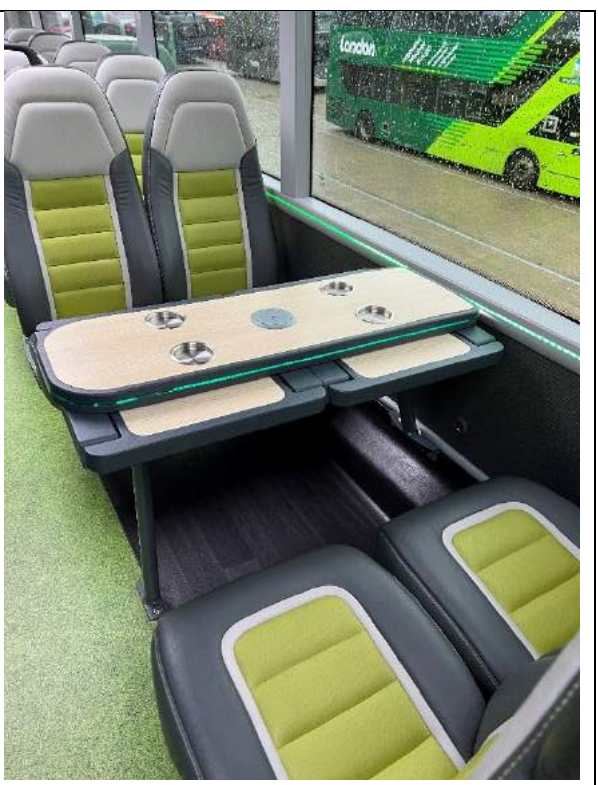
Figure 4:tables in latest design buses