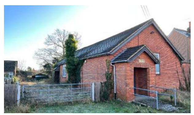
Figure 9:Garth Club, St John's Road, Mortimer

As reported <u>HERE</u>, the Royal British Legion (London branch) recently announced its intent to relinquish its role as trustee of the Garth Club, that was used in earnest for diverse events from 1915 to 2011. The RBL called for anyone interested in taking it over to come forward by 30 November. I've become deeply involved in this longrunning matter since joining the parish council in 2015. I felt/said, and later formal and informal legal advice