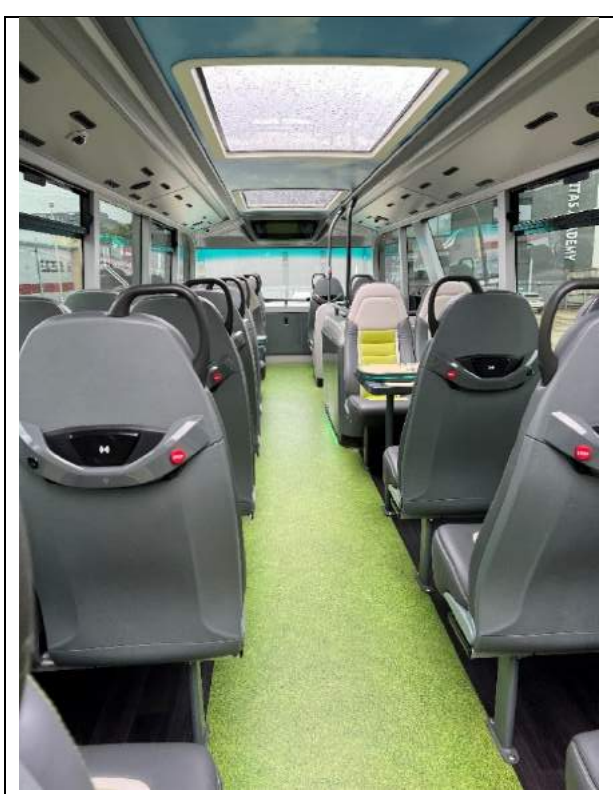
Figure 3:top floor of EV bus